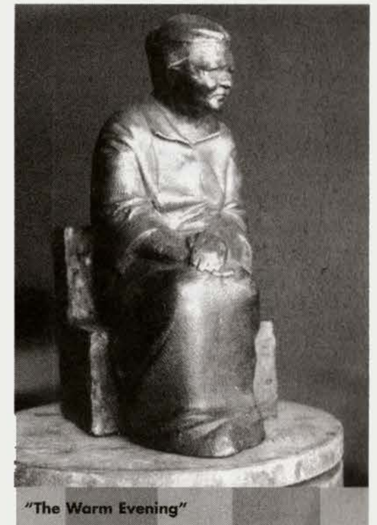
"The Warm Evening"